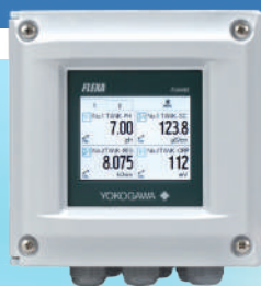
FLXA402 Ultimate Analyzer