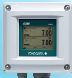
FLXA202 Upgraded 2-wire Analyzer