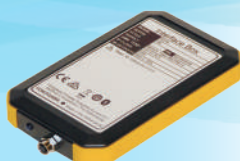
IB 100 Interfacebox