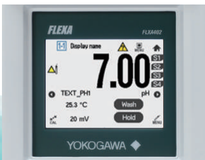
Easy to use touch screen