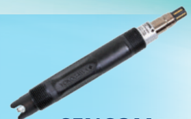
SENCOM Sensors for SA11