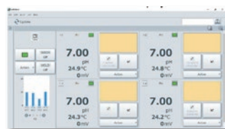
4 sensors display