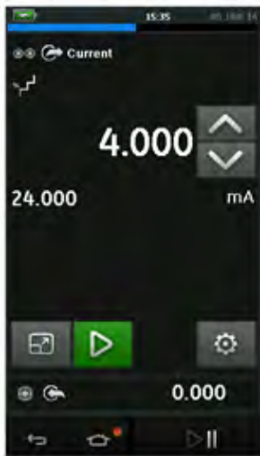
25% step manual advance