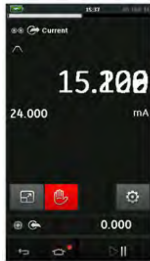
RAMP automatic cycle

Nudge: Simply used to make a small incremental change to a mA output using up/down keys. This is great for determining trip values.