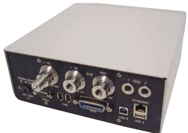
PACE1000 from the rear