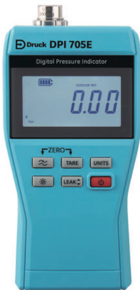
Safe Area Pressure Indicator