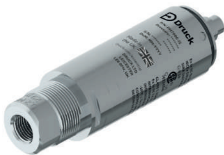
PM700E (Gauge, Absolute)