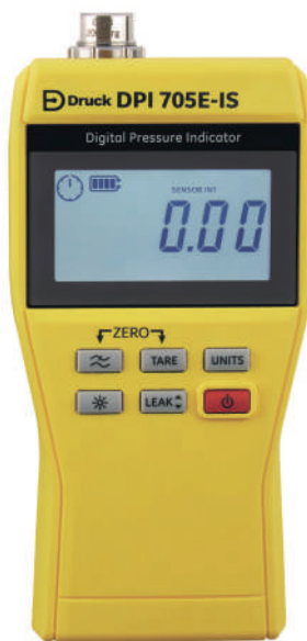
Hazardous Area Pressure Indicator

The Druck DPI 705E Series of handheld pressure and optional temperature indicators combine tough and rugged design with accurate and reliable measurements.