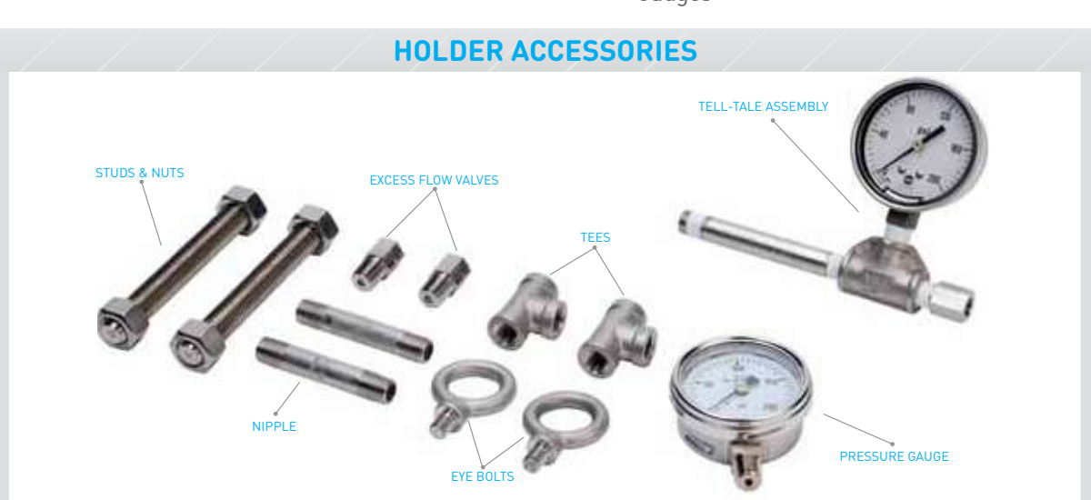
<sup>1</sup> ASME SA-193-B7 studs, SA-194-2H nuts